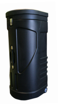
Half Hard Case is optional.