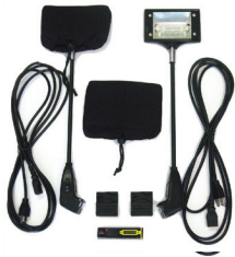
*Optional 200 watt halogen lights