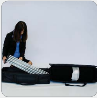
TABLE TOP POP UP DISPLAY—QUICK START INSTRUCTIONS

1. Remove frame from case and place on floor. Remove also panels from the other case and place on floor.